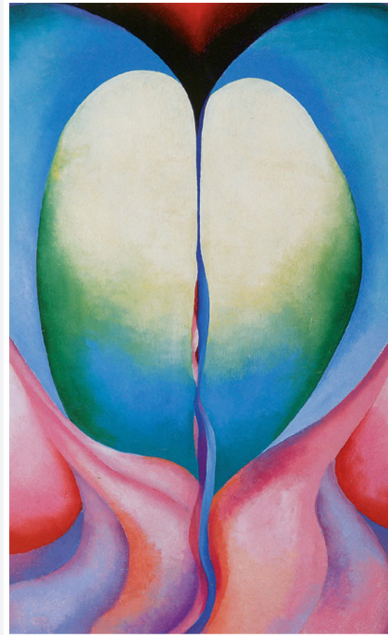
Series 1, No. 8, 1911, by Georgia O'Keeffe